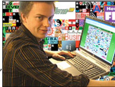
Creator and creation

It took a 21-year-old a few minutes to come up with an idea which has made him more than one million dollars in four months. So what's his secret?