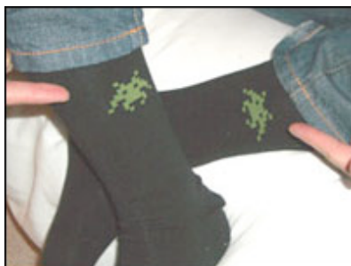
A millionaire's proud purchase